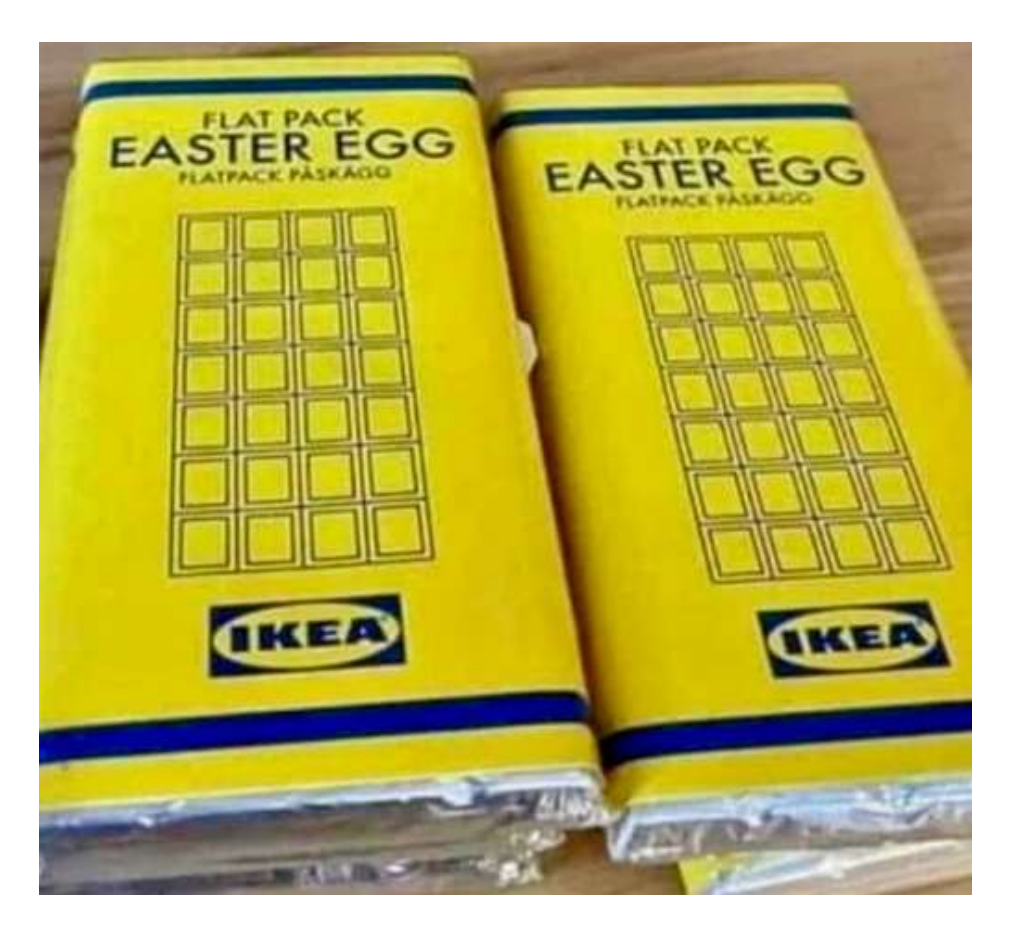
Better hurry, they are flying off the shelves.