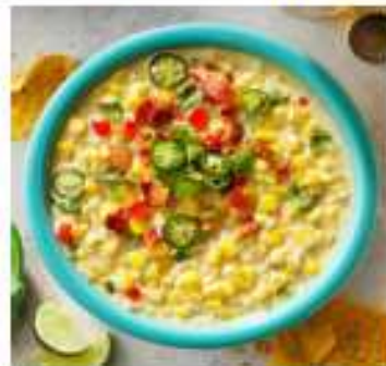
Mexican Street Corn Chowder